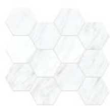
3.25" Hexagon Mosaic on 10"x11.5" Sheet