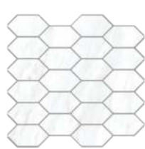
2"x4" Diamond Blend Mosaic Mosaic on 10"x11.5" Mesh Sheet