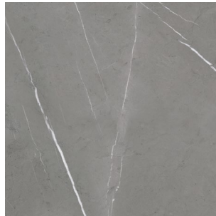
Fumo di Londra Grey